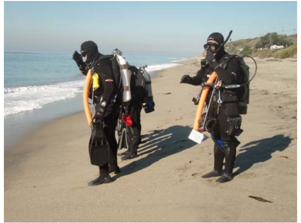
D&D team timing the sets