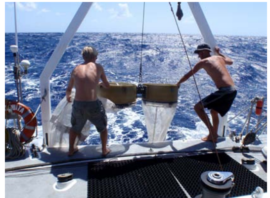
Algalita staff deploying bongo nets.

The captured plastics are sorted according to size, color and type. An expedition may sample many areas in the gyre and the amount of plastics