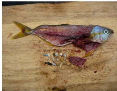
Plastics found in dissected fish.

Contaminants that are in the air can be absorbed into the water and attach to particulate materials, including floating plastics. Algalita-sponsored studies have found that floating plastics attract pollutants and carcinogens, concentrating these on their surfaces. The bad chemicals include persistent organic pollutants (POPs), including polychlorinated biphenyls (PCBs) and polycyclic aromatic