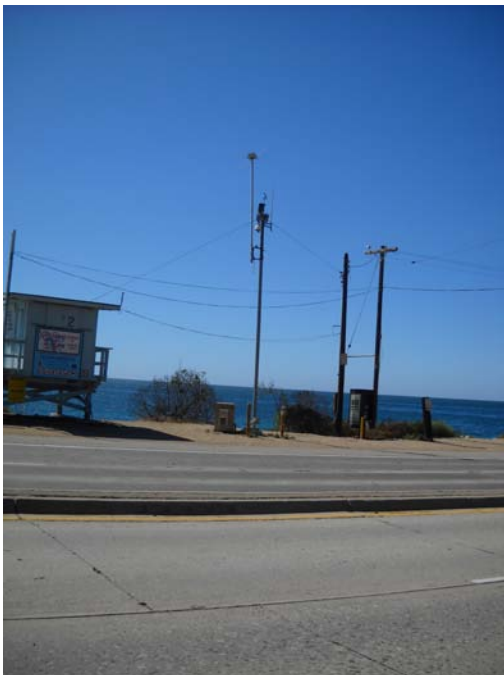
HF radar at Corral Creek, Malibu.

Of course, knowing the direction of currents is very useful, permitting better management response to hazardous conditions and disasters, assisting coastal resource management, and enabling better scientific understanding of coastal processes. Chief proposed uses include the prediction and tracking of where bad water is heading. Bad water includes that contaminated by oil and sewage spills or river discharges. Although