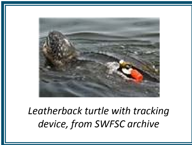
Leatherback turtle with tracking device

The Protected Resources Division conducts Federal research supporting the Marine Mammal Protection Act and the